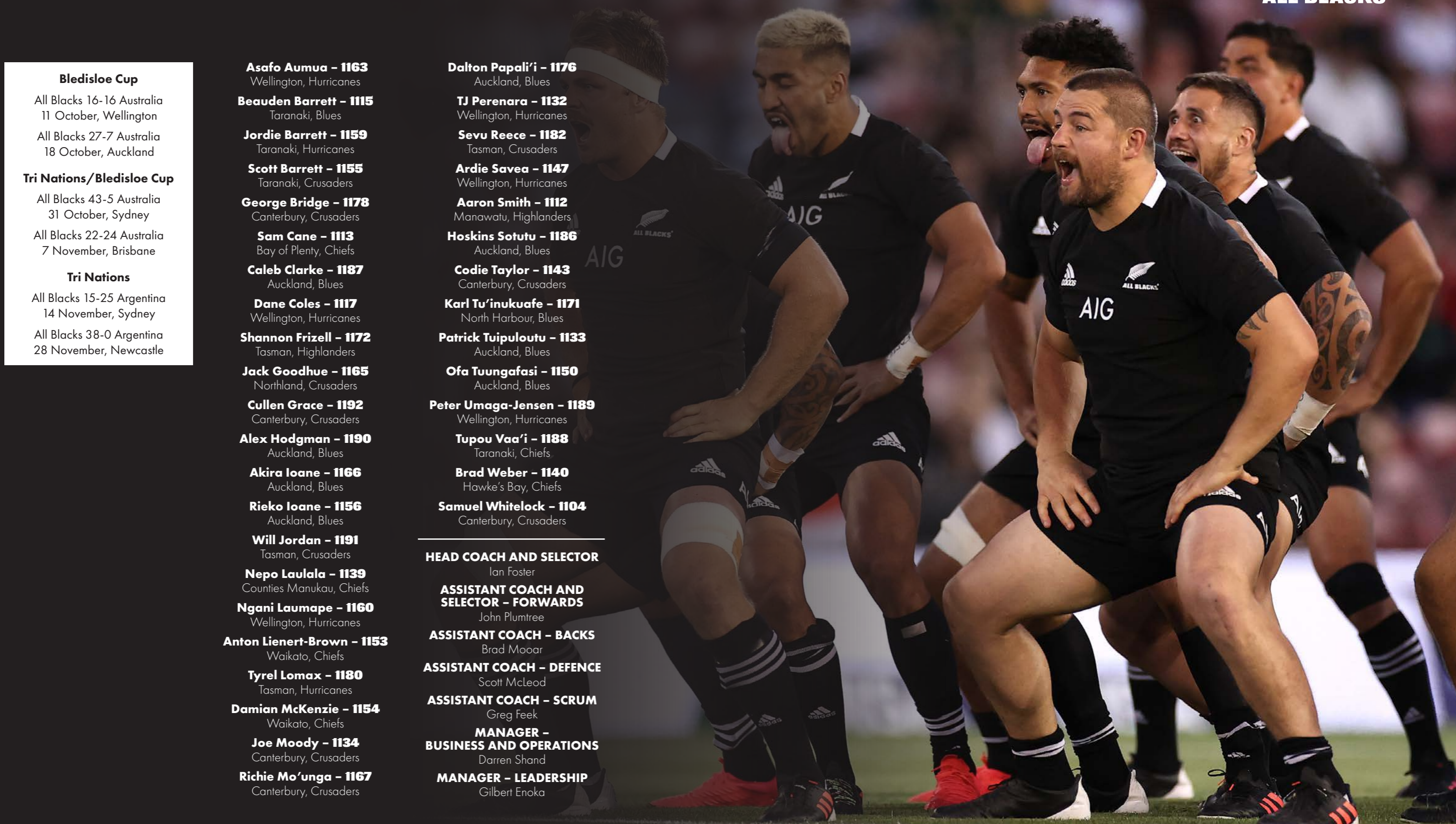
Sam Cane leads the All Blacks in haka before a Test match.