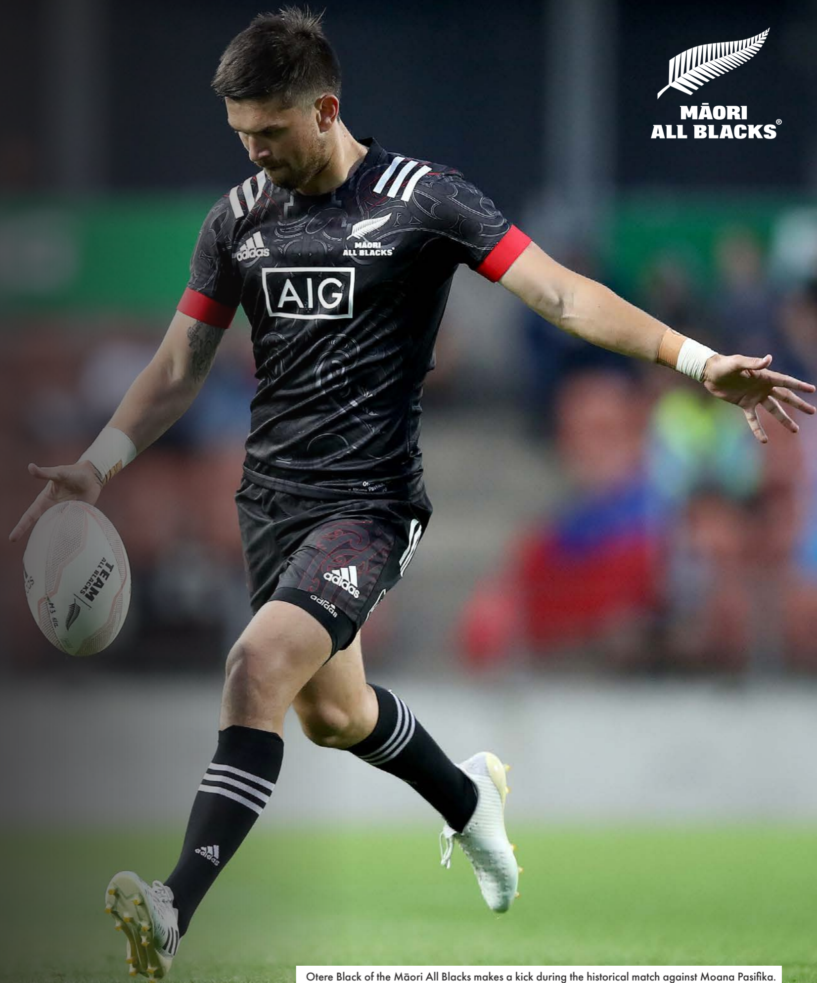
Otere Black of the Māori All Blacks makes a kick during the historical match against Moana Pasifika.