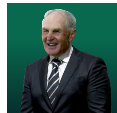
Ian Kirkpatrick Patron

The New Zealand Rugby Patron fills an honorary role as the figurehead for the organisation. Throughout the 20th Century the Governor General traditionally held the role of Patron. Sir Brian Lochore was Patron until his passing in August 2019, and Ian Kirkpatrick, was elected as his successor at the NZR Annual General Meeting in 2020.