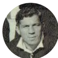
Raymond 'Rocky' Parr Māori All Black (1955) Wednesday, 15 July 2020, aged 89