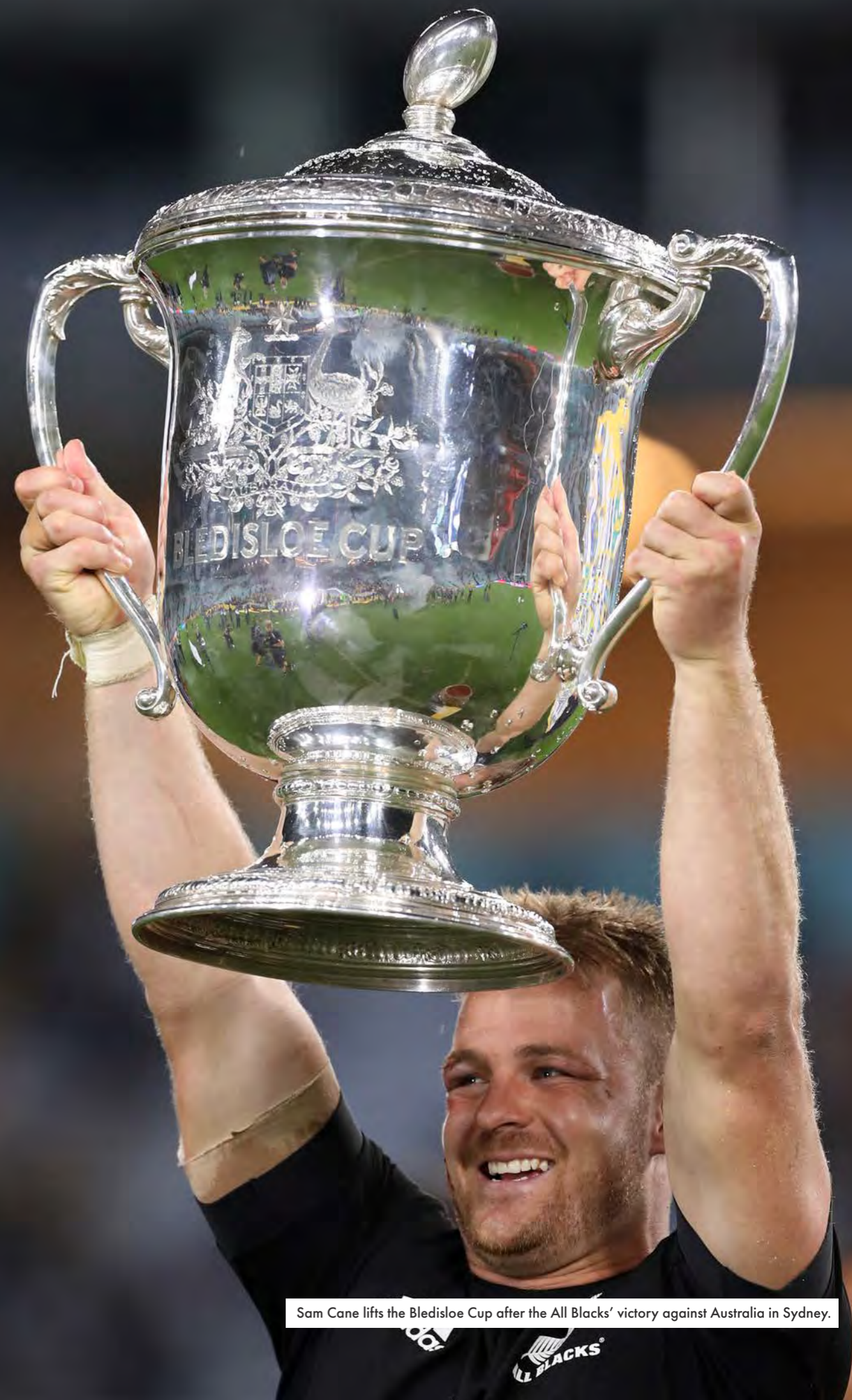
Sam Cane lifts the Bledisloe Cup after the All Blacks' victory against Australia in Sydney.

However, we have (and not surprisingly through COVID-19 in 2020) continued to spend more than we earn, so increasing our earnings couldn't be our only strategy to help get us through a difficult year and reset the way we deliver rugby in New Zealand. As mentioned in the overview for Ngā Miro, our work towards efficiency in how we invested into the sport and our activities is just as crucial in achieving in this area and will be a key component of our business health and ability to meet our goal to 'earn more than we spend' into the future.