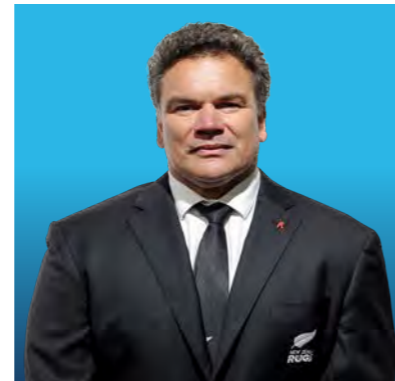
Sir Michael Jones Elected Board Member NZR Board member since 2018.