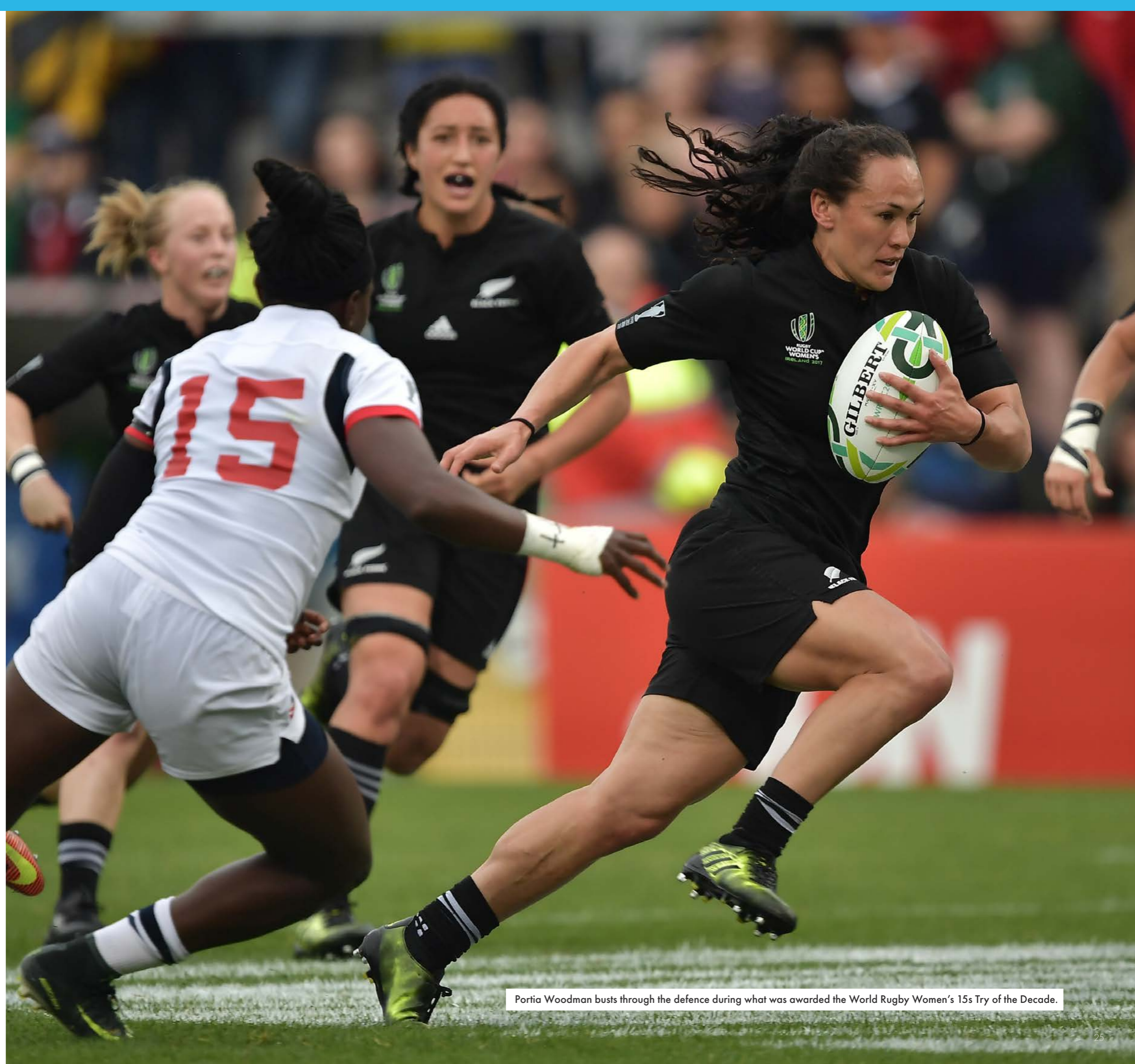
Portia Woodman busts through the defence during what was awarded the World Rugby Women's 15s Try of the Decade.

Note: Due to the COVID-19 pandemic cancelling or postponing many sporting events throughout 2020, some awards ceremonies were cancelled or took the opportunity to reflect over the past decade.