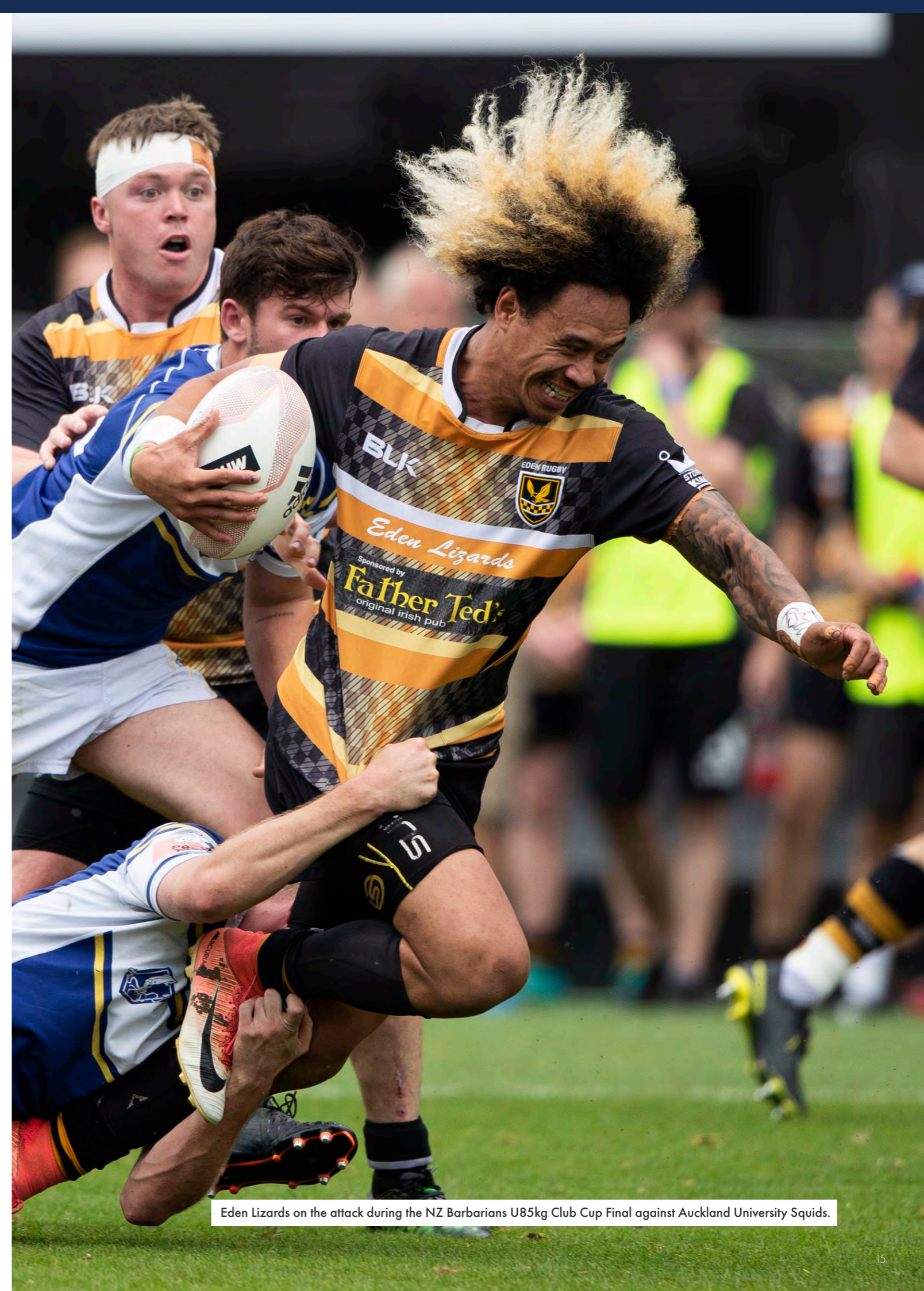
Eden Lizards on the attack during the NZ Barbarians U85kg Club Cup Final against Auckland University Squids.

Looking forward to 2021, across our teams and programmes there are so many great opportunities to reimagine rugby. With the growth of women's sport around the world, and New Zealand's hosting rights for upcoming Rugby World Cup, we have the chance to develop the Black Ferns' brand to