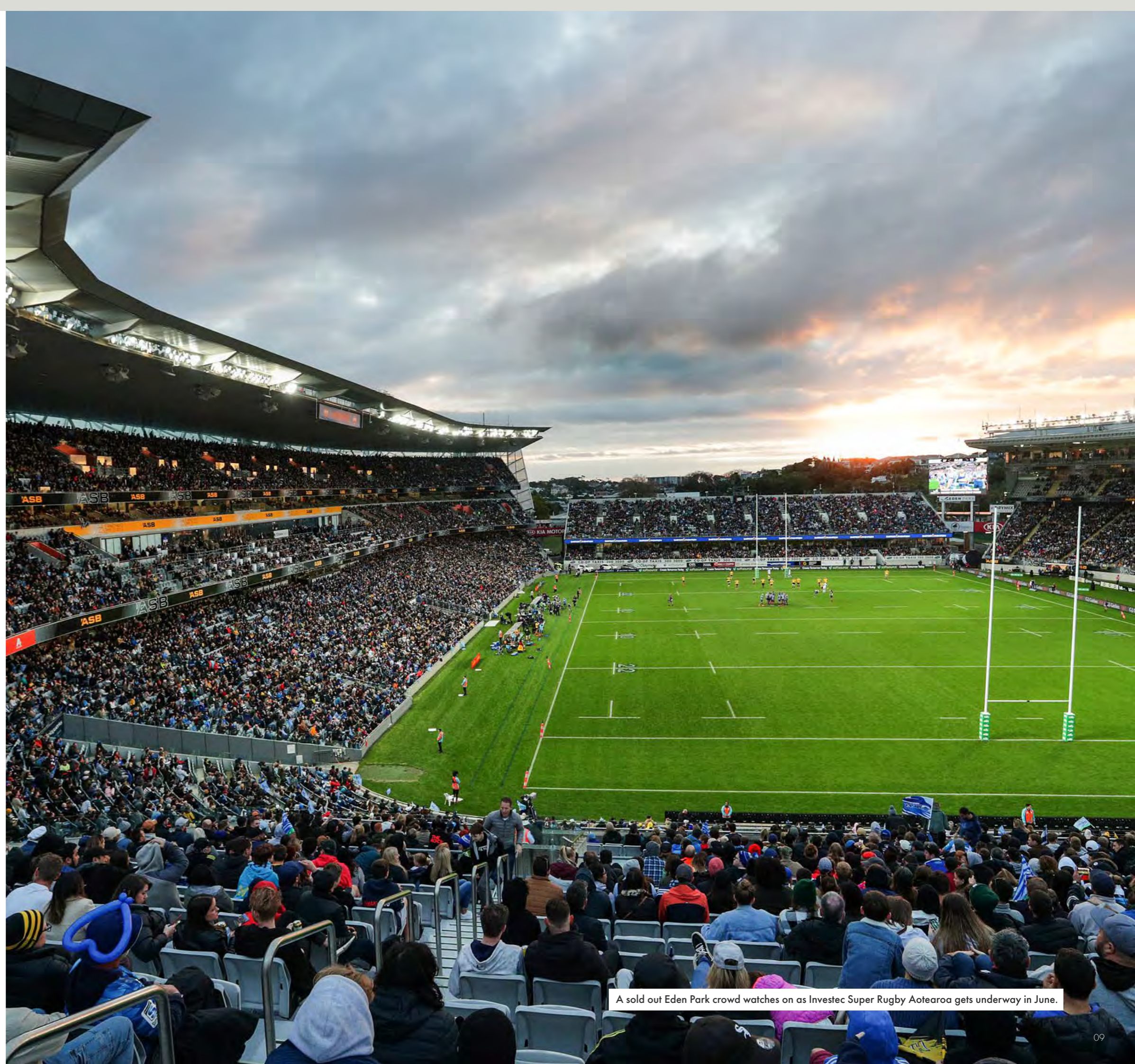
A sold out Eden Park crowd watches on as Investec Super Rugby Aotearoa gets underway in June.